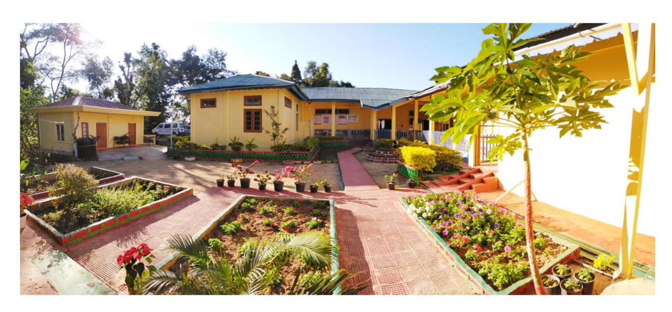
Pic : Aibawk PHC