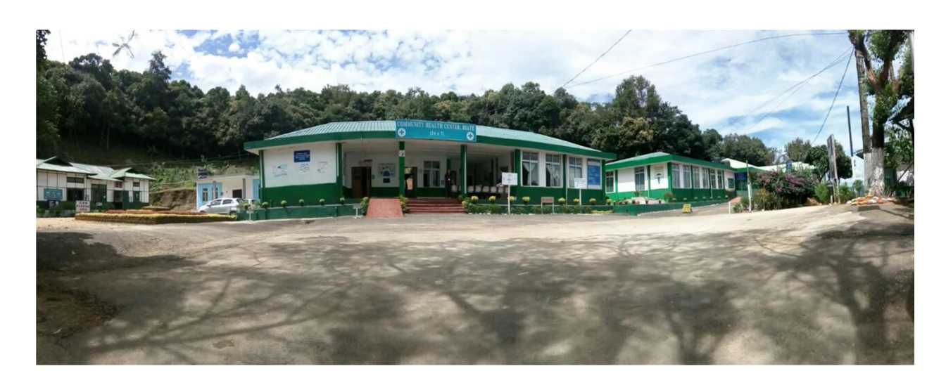
Pic: Biate CHC, Winner Of Kayakalp 2017, 2018.